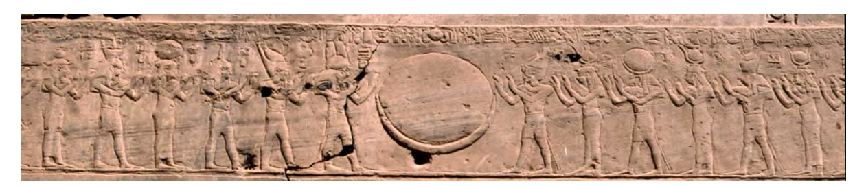
Fig. 1 Gods worshipping the moon. A Ptolemaic relief from the temple of Khons, in the Amun-precinct at Karnak.